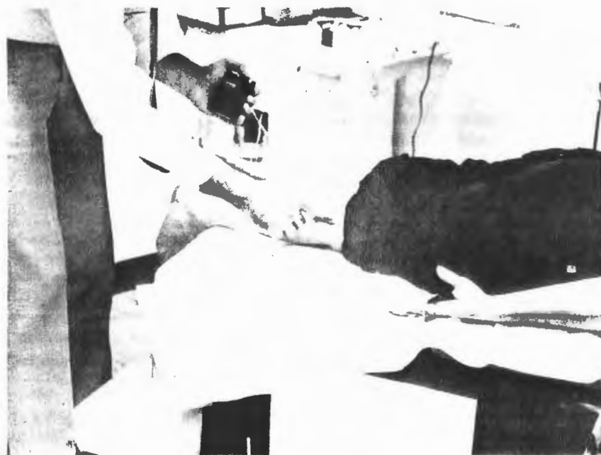
Fig. 3. With one electrode still in the patient's hand, the common peroneal nerve is stimulated in the lateral retropliteal fossa producing paresthesia in the dorsolateral leg and foot.

electrically to alleviate pain in such cases.