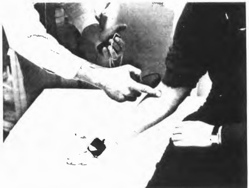
Fig. 2. Using the index finger of the hand holding the electrode, the therapist probes for the lateral antebrachial cutaneous nerve in the antecubital fossa.

Therapists should certainly experiment with this technique on each other to become familiar with all aspects of the sensations produced and the points on nerves at which they are produced before attempting to use this technique on patients. For example, by probing just lateral to the tendon of the biceps brachii in the antecubital crease, you can locate the lateral antebrachial cutaneous nerve that produces paresthesia extending along the radial aspect of the forearm (Fig. 2). Moving the finger medially along the crease and halfway between its end and the medial epicondyle, you can find the superficial point of the medial antebrachial cutaneous nerve. Stimulation here produces paresthesia extending down the ulnar aspect of the forearm. In the lower retropliteal space just medial to the tendon of the biceps femoris muscle, a superficial point of the common peroneal nerve may be found (Fig. 3). Because this nerve communicates with the medial sural cutaneous nerve to form the sural nerve, stimulation at this point will elicit, in the posterolateral leg, paresthesia extending behind the lateral malleolus and onto the dorsum of the foot. This nerve is sometimes involved in a form of sciatica and may be activated